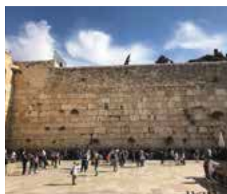
Figure 6 - A view of the Western Wall in Jerusalem.