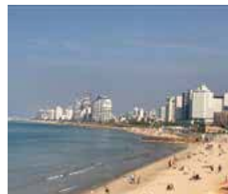
Figure 5 - A view of the Tel Aviv Beach.