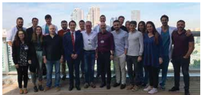
Figure 2 - With the faculty members, residents, and international fellows of the department.

breast reconstruction, and craniofacial surgery. It is the largest training program in Israel with residents not only from Israel, but also from some European countries and even from Palestine. The department has a very strong tradition in international plastic surgery education and has trained many foreign fellows. Each faculty member has done fellowships in the United States or Europe. They have not only a very cutting-edge reconstructive surgery practice in this public hospital, but also a private practice in other private hospitals. This is how they can maintain a cutting-edge reconstructive surgery practice as well as a private cosmetic surgery practice to augment their income. However, each faculty surgeon expressed to me their passion for excellence in plastic surgery.