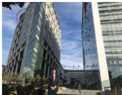
Figure 3 - The author in front of the Tel Aviv Sourasky Medical Center.

The third part of this scientific exchange was a lecture on breast reduction for the residents. I explained my criteria for patient selection and the preferred technique for inferior pedicle breast reduction as well as medical breast reduction. I also showed a video on how that procedure is performed in my practice. I also discussed other related techniques such as vertical mastopexy or inverted mastopexy.