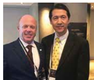
Figure 7 - With Dr. Yoram Wolf, the ISAPS National Secretary for Israel during the 2019 Israeli Society of Plastic and Aesthetic Surgery annual meeting.